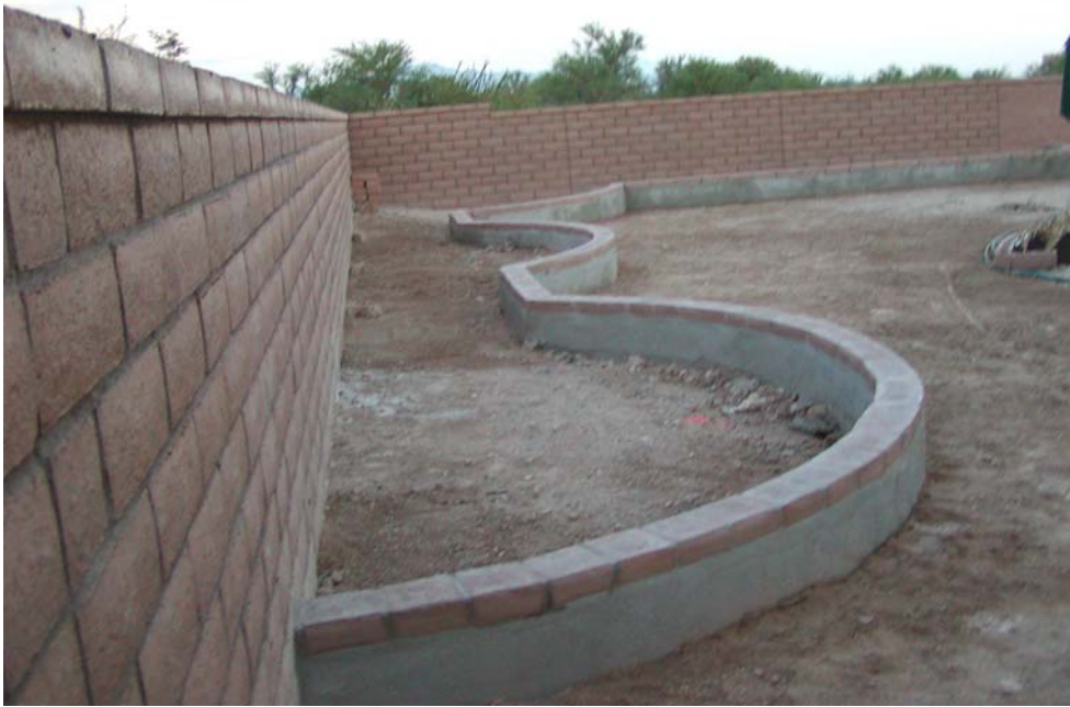
The first raised beds

I filled the beds half way with top soil from Pioneer and the rest of the way with their Mulch Mix. I then used my electric Mantis roto-tiller to mix some of the soil into the mulch. This gave me a humus rich soil that holds water well.