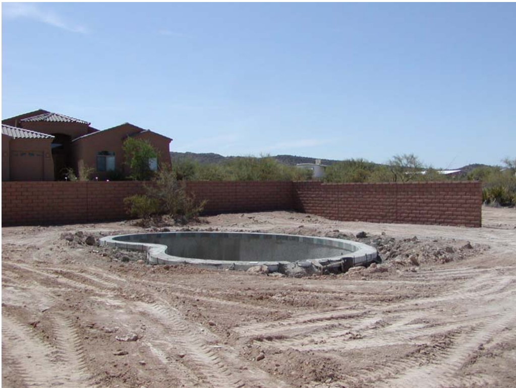
My blank canvas

The other issue was to get my rhizomes moved without loosing them or loosing track of their names. I made a photo listing of all the Iris that bloomed last year. Then I divided my plants and packed two of each cultivar in shredded news paper. When I arrived in July, I planted them all in temporary beds with a sprinkler system on a timer that was set for 15 minutes a day.